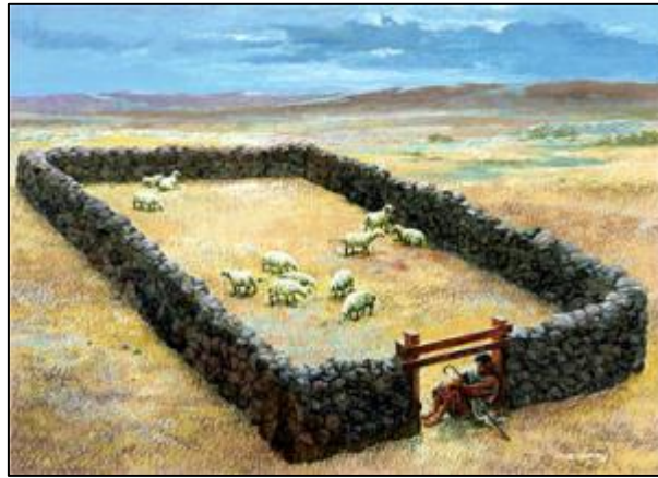
I am the gate of the sheepfold...

In the gospel passage from St John, we have the image of Jesus as the Good Shepherd. The Lord used the image of sheep and shepherd as it was an image the people would have understood. He tells them that he is the true shepherd who looks after the sheep but, rather than drive the sheep, he leads and they follow. He also described himself as the gate to the sheepfold. The people would have understood that the sheep would properly enter the enclosure through the gate and that those who took the sheep by a different access point were thieves. We can see in this a warning that there will be those who will come with a teaching which may sound nice and encourage us to live life as we want, but this teaching will not lead to eternal life but will cause difficulties for us. The teaching of Jesus and his sufferings for our sake are the only things that can lead us to the true and eternal life in the Kingdom, and that is what we must listen to and live by. There are many messages and teachings to be heard in the world today but only one of them can lead us to true fulfilment in this life and in the next. The Lord didn't say that he was 'a' gate to the sheepfold but 'the' gate, and so there is no other way. Twice in the passage the Lord used the phrase 'I am' which reminds us of the conversation between God and Moses at the burning bush in which God revealed himself as 'I am', and so we see the connection and union between God the Father and God the Son.